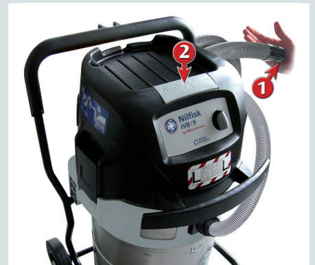
With Push&Clean, all you have to do to clean the filter, is to cover the fitting or the hose and press the button. Powerful air pulses will clean the filter gently, and you are back to work in no time.