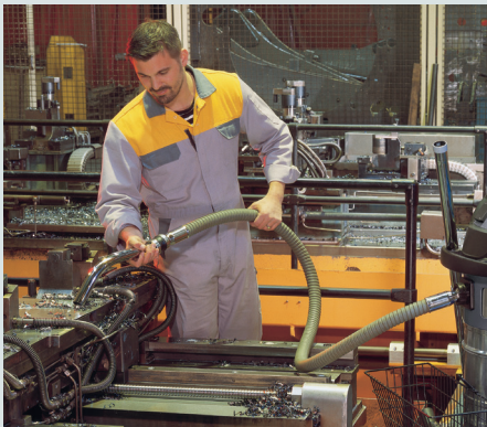
For fast pick-up of either liquid or powder spills, or for specific applications such as metal chip removal, the Nilfisk IVB range of industrial vacuums is the smart choice.