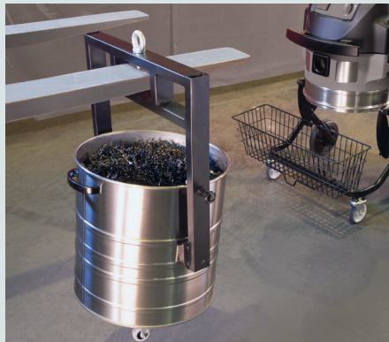
The optional forklift device helps you to empty the container and saves back strain